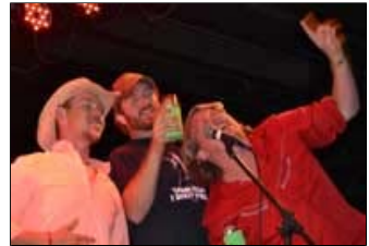
↳ T-Birds Garage Pub Main Stage - 11:30 PM ↳ Eleven Hundred Springs who played after the music ended on the main stage and they packed the house and the dance floor